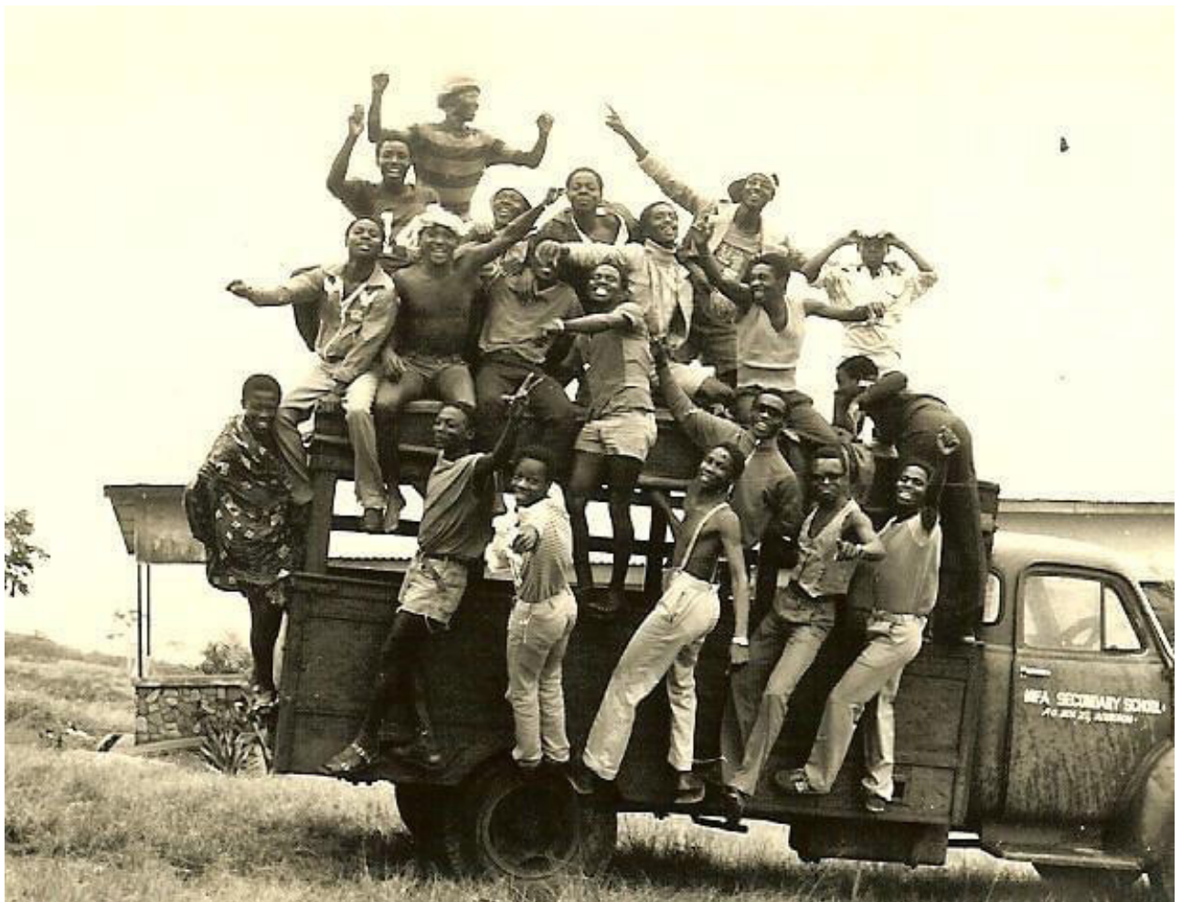
Students having fun on the Nisec boneshaker around the early 1980s