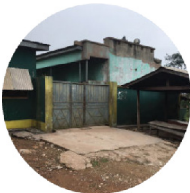
A dilapidated kitchen and pantry at Nifa Senior High School

At December 31, 2018, NAA had 63 members spread across Europe, the United Kingdom, Australia, Canada and the United States. The organization’s principal mode of communication is electronic, based on Whatsapp group platforms, where most discussions, announcements and voting take place, with meetings held via telephone conferencing where possible. NAA is guided by a constitution adopted by members on April 1, 2016.