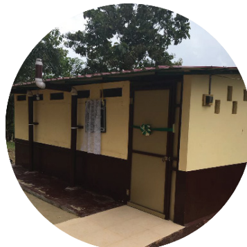
Ten-seater biofil toilet system at Nifa Senior High, funded by NAA