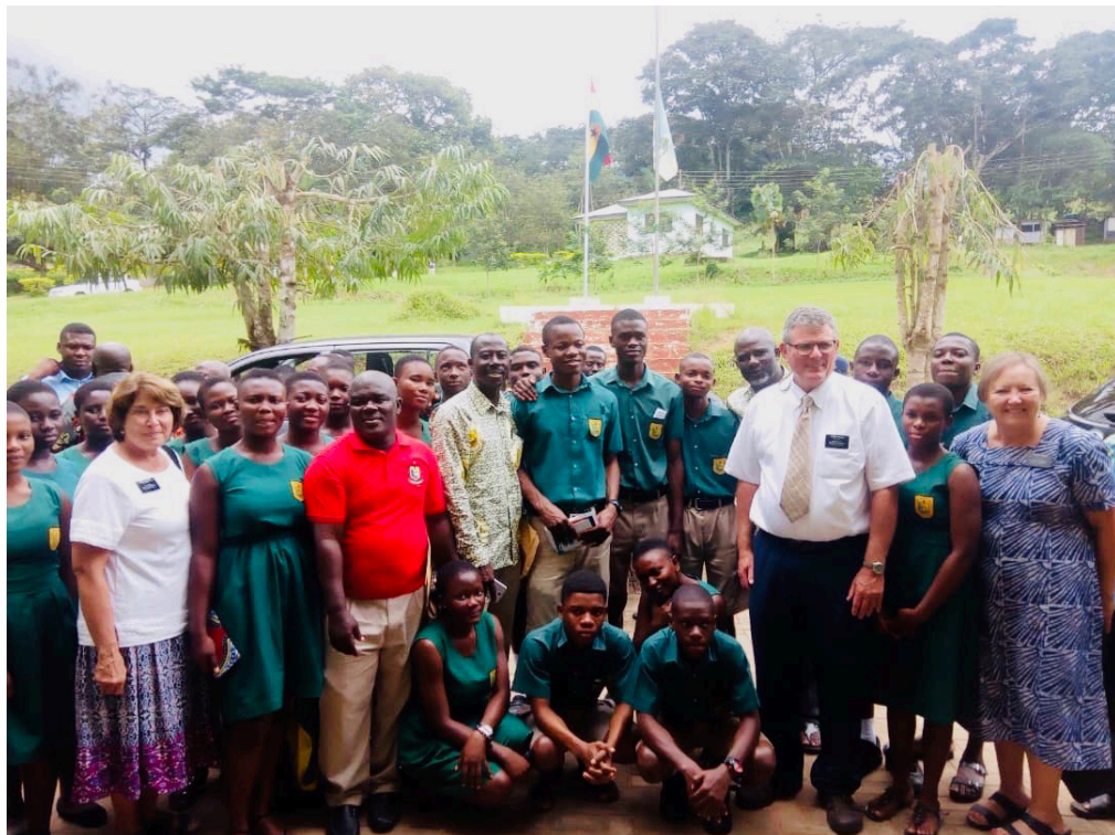
Nisec students, NOSA members and officials from the Church of Jesus Christ at the project commissioning