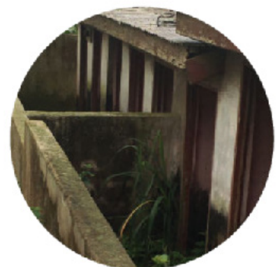
A disused toilet facility at Nifa Senior High School